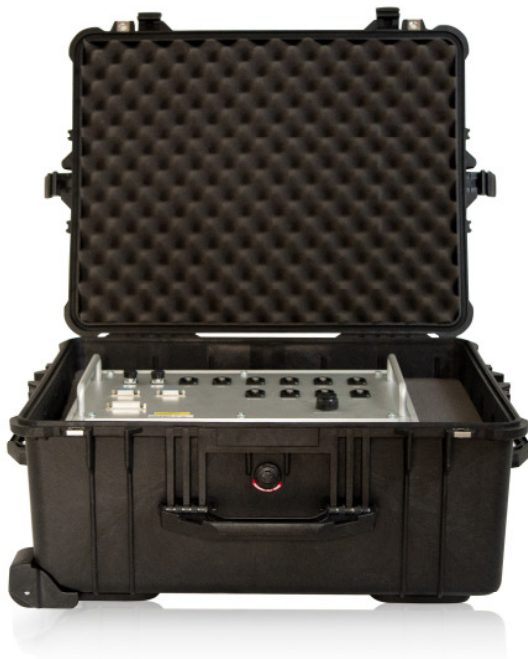
Fig. 4: Measurement box in transport case