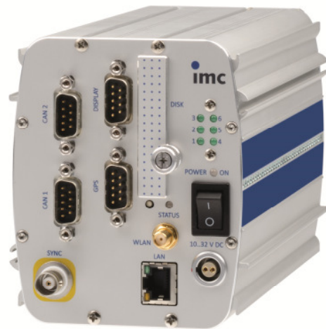
Fig. 5: imc C-SERIES model CS 7008 / model CS 4108

The imc C-SERIES measurement devices are compact and robust and are suitable for mobile applications. They offer measurement data acquisition with additional control functionality in one system and synchronously acquire analog, digital and CAN-based signals.