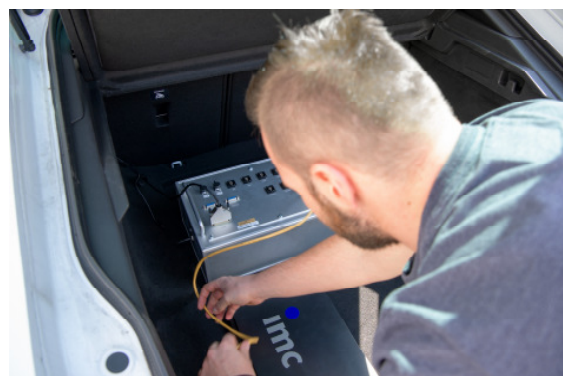
Fig. 2: Connecting to CAN bus and Wi-Fi