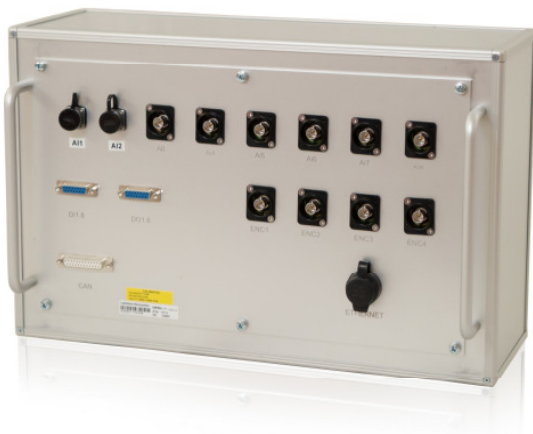
Fig. 6: The imc measurement box for WLTP testing

There is also a channel and connection for a flow meter to record the fuel measuring signal.