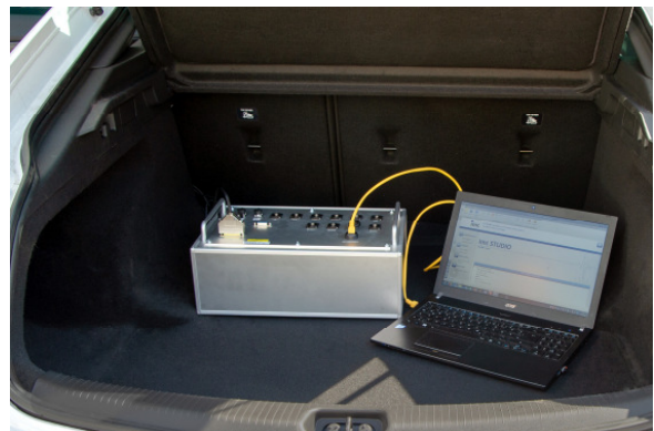
Fig. 3: The imc measurement box with laptop in the trunk.