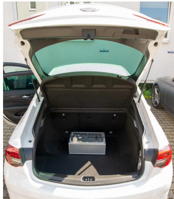
Fig. 7: Autarkic operation of the measurement box in the car

The imc C-SERIES also includes the real-time system imc Online FAMOS, for demanding real-time analysis and control tasks. imc Online FAMOS is able to perform mathematical calculations and also to realize process controls and test bench automation up to complex control algorithms (incl. PID). Even during the measurement it is possible to display measured values in real time via imc Online FAMOS.