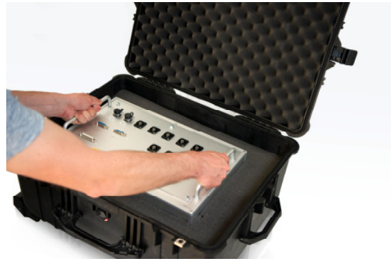
Fig. 1: Easy handling of the imc measurement box

The user connects to the measurement box via Ethernet or Wi-Fi via a laptop and starts the WLTP application in imc STUDIO. This combines the configuration of the measurement device, data recording and automated data evaluation in one application.