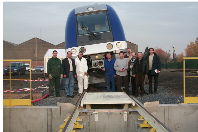
The Bombardier test team in Crespin

Altogether, with the help of the outstanding performance of imc's CRONOS PL, Bombardier's engineers worked out and performed this superlative structural test successfully. Another proof of imc's expertise in measurement & control technology.