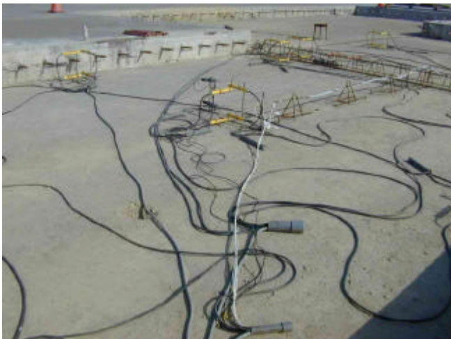
More than 70 sensors are placed inside the runway

Due to the distribution of sensors all over the runway's landing point, a decentralized measurement system was required. The data transfer between the individual measurement boxes (CANSAS) and the data receiver (busDAQ) uses the reliable CAN-bus technology.