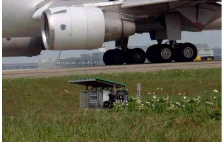
The sensors signals are transmitted via CAN-bus

The purpose of this monitoring system is to study the long-term physical behavior of the concrete pavement. This instrumentation system is being utilized to measure the response of concrete pavement structures to aircraft traffic and to measure changes in environmental conditions. The acquisition of response data is performed in real-time. Data collection will be continued for a further three years to study the field performance of concrete airport pavements.