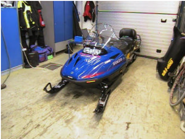
The tested snowmobile (Ranger) in the lab

High-performance, a motto we see in so many fields today that we don't even attempt to count them. But modern snowmobiles unquestionably deserve that epithet, especially if they are competing for the world championship.