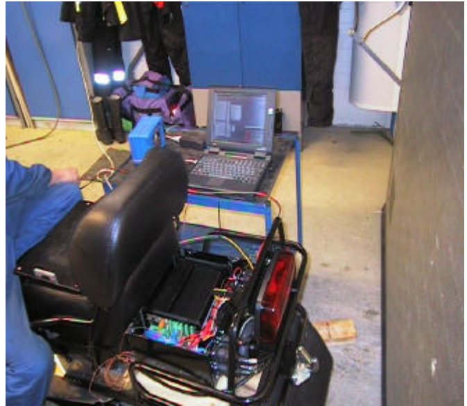
A \mu -MUSYCS fitted into the snowmobile

The goal of the measurement is the improvement of the power train – the soul – of the vehicle. As similar applications indicate, the main requirement is a small and rugged system with excellent