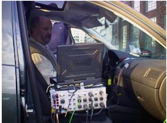
\mu -MUSYCS-T with a special back panel

Online data reduction, FFTs, digital filters, class-counting functions (LDC), order tracking and an 'Event Log-book' are all featured in the broad scope of the 100 online functions. The system allows a measurement's results to be displayed while it is still running.