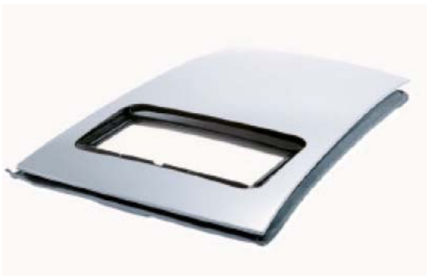
ArvinMeritor sliding roof

imc's hardware & software forms an excellent framework for small test rig applications. Not only for data measurements and online result extractions but also for open loop control purposes. New test benches belonging to ArvinMeritor provide a typical example for this. The German manufacturer for car components has recently constructed new sliding roof quality & life-cycle test rigs using imc's modern technology. Five fully automated test rigs can be used to develop, test and improve the quality of sliding roofs.