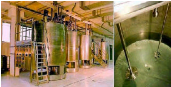
Agitators are equipped with mechanical seals

Mechanical seals are very small but nevertheless very important. On rotating shafts and axels such as we find in pumps or agitators is where these small and mostly invisible helpers can be found. The importance of a mechanical seal is very great. Especially since such little parts, once defective, can halt entire production lines or chemical processes. John Crane is one of the leading companies in development, construction and production of mechanical seals. A mechanical seal leakage test rig based on imc's \mu MUSYCS has been installed in its German plant in Fulda.